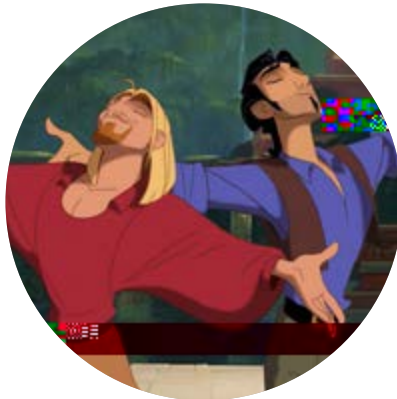
FILM The Road to El Dorado

This is a weird movie for me to write about. It has a large cult following, but barely anyone has seen it. It was made by DreamWorks, and immediately got overshadowed by their other smash-hit movies, so it never really got the reception it needed. The story follows no conventional trends, it goes all over the place, exploring new themes and ideas all the time. It is loosely based around its action sequence where both pretend that they did not know the other one rigged merchant stands, spewing one liners all the while. They escape, but not before being forced onto a ship of conquistadors, coincidentally, heading to the lost city of gold, El Dorado. As an aside, the music in the movie is all amazing, not a single song feels out of place. I need to cut this review short, and although I probably did not convince a single person to watch the movie, I urge you to at least give it a chance. It is a fantastic adventure story with the right amount of tension and