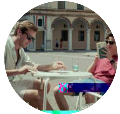
FILM Call Me by Your Name

Call Me by Your Name is one picturesque, romantic coming-of-age movie set in the blossoming romantic relationship between 17-year-old local Elio and visiting doctoral student Oliver, who together discover of northern Italy.